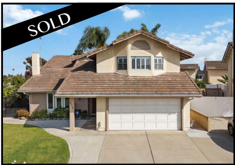
10674 El Morrow Circle, Fountain Valley Represented Buyer SOLD! for $1,775,000